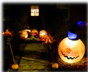
9 Farm Road