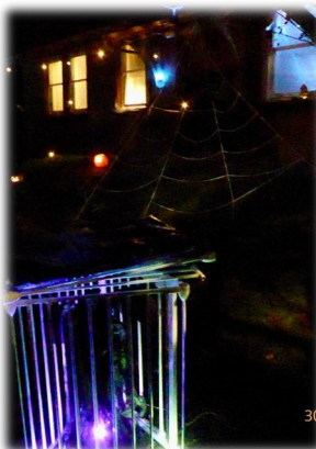
30 Dupplin Road