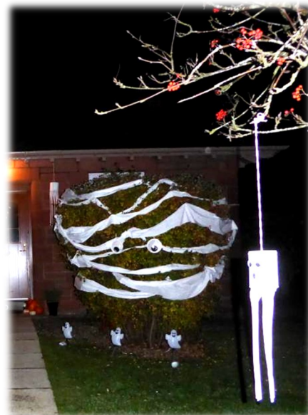
5 Farm Road