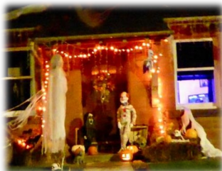
23 Haddon Road