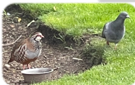
Gannochy Corner