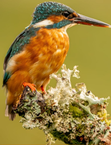
Kingfisher. A regular Quarrymill visitor